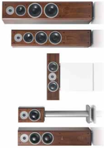
Every Dynaudio loudspeaker is carefully made in Denmark. Find more information at www.dynaudio.com .

Everyone who loves music not only wants to hear it, but to experience it – everywhere.