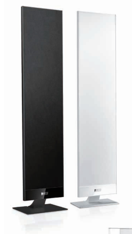
T301 and T301c speakers.

Mounted vertically as satellites (whether wall-mounted, on the desk stands supplied or the optional floor stands) or horizontally as a centre channel above or below the TV, the standard T Series speaker features KEF's new 115mm (4.5in.) ultra-low profile bass and midrange driver paired with the high performance new 25mm (1in.) vented tweeter.