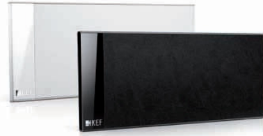
T101 and T101c speakers.

Mounted vertically as satellites (whether wall-mounted, on the desk stands supplied or the optional floor stands) or horizontally as a centre channel above or below the TV, the standard T Series speaker features KEF's new 115mm (4.5in.) ultra-low profile bass and midrange driver paired with the high performance new 25mm (1in.) vented tweeter.