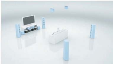
Dolby Atmos 5.2.2ch Speaker System